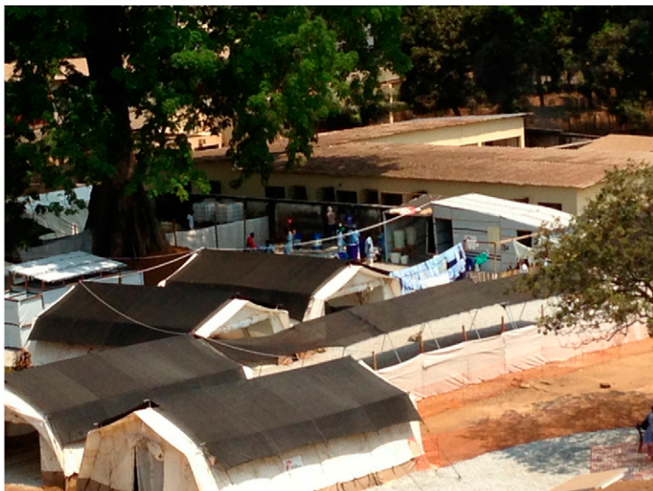
Figure 2. Conakry, Guinea Ebola virus treatment facility.

a disposable impermeable gown and apron, and facial protection with a face shield or goggles and a mask, are effective at protecting healthcare workers from coming into contact with infectious body fluids (12). Although there is a distinct lack of respiratory involvement, additional precautions may be warranted if droplet or aerosol-generating procedures are performed; however, procedures such as intubation and ventilation are not practical options in most West African outbreak locations.