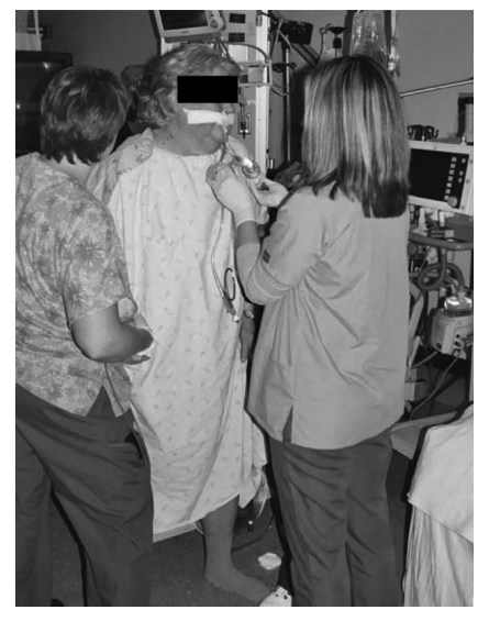
Figure 2. An orally intubated level intravenous patient, exercising while standing.